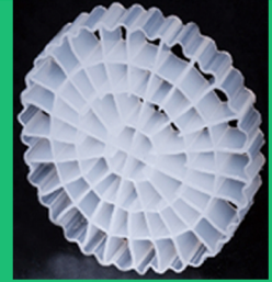
XLB-10 ( PE10 )